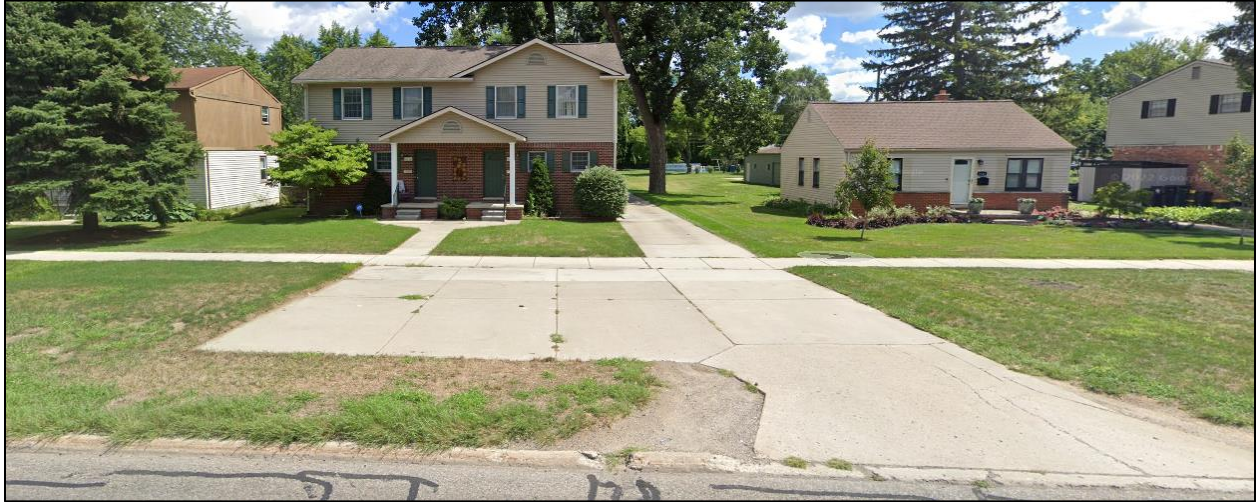
4622-4624 Rochester Road (duplex)

Concrete parking pad, moderate condition, duplex property, placed in late 1990s